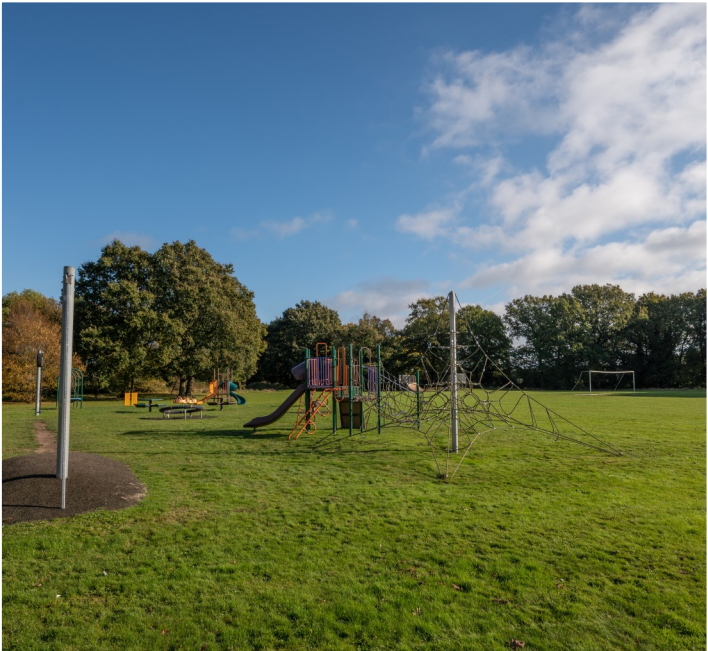
Lady Nelson Playing Field