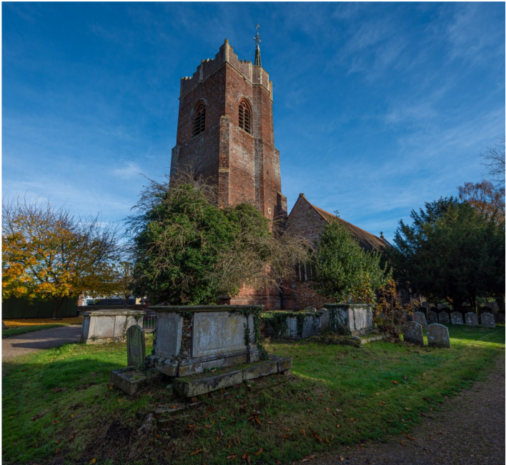
St Michael's Church